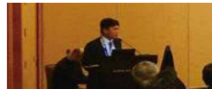
Ship machinery and equipment makers deliver presentations.