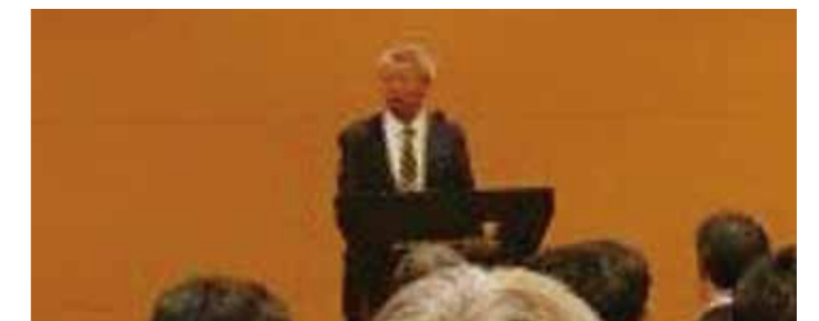
Many people gather at the reception.