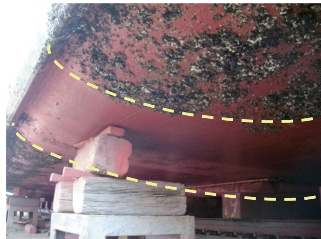
1 year performance after long anchorage (in Tokyo bay)