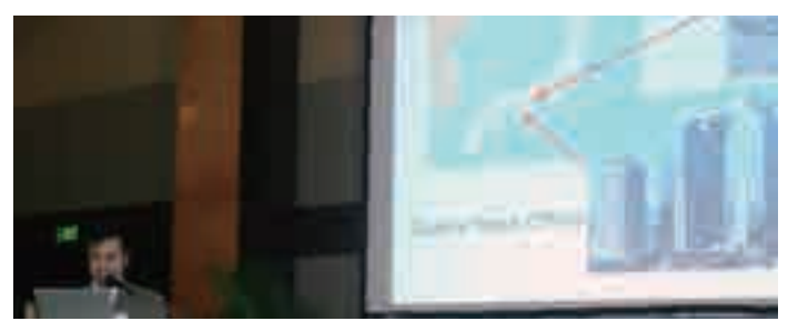
A JSMEA member company delivers a presentation.