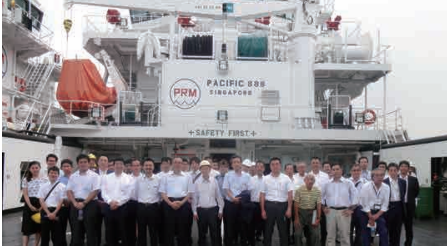
The JSMEA delegation visits Pacific Richfield Marine.