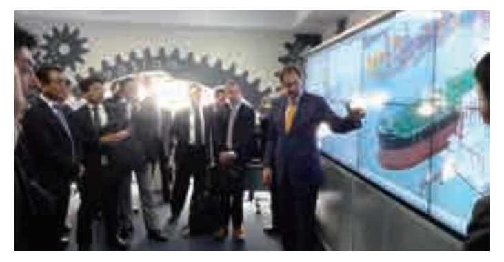
The JSMEA delegation receives a lecture on the Krylov State Research Centre.