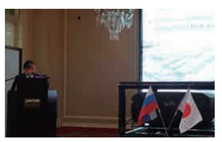
JSMEA member companies give speeches.