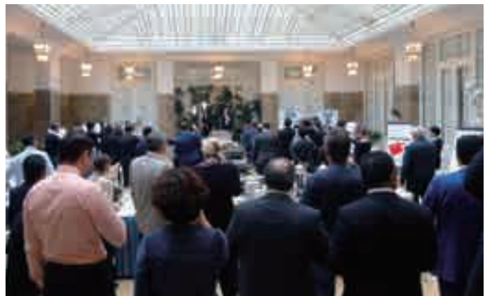
A reception is held after the seminar.