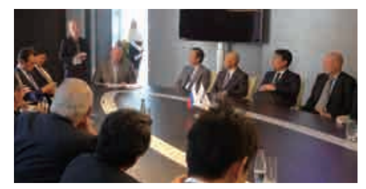
The JSMEA delegation learns about Sovcomflot.